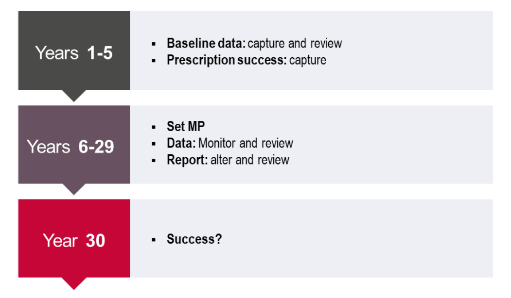
Diagram 2: Proposed timeline for LR

A section 106 agreement is an agreement between a developer and a local planning authority about measures that the developer must take to reduce their impact on the community. A section 106 agreement is designed to make a development possible that would otherwise not be possible, by obtaining concessions and contributions from the developer. It forms a section of the Town And Country Planning Act 1990. A section 106 agreement must meet the following requirements: must be necessary to make the development acceptable in terms of planning; must be directly related to the development in question and must be fair in terms of scale and type when compared with the development. Beyond these rules, viability and the wider economy play a role in determining the scope and scale a section 106 agreement should have. It is a useful tool for Local Planning Authorities to negotiate with developers – it could be that monies identified within a s106 agreement could be used to provide funding for LR. Alternatively, specific works can be identified and progressed within the s106 as long as relevant to the local community (restrictive); the benefit is that it is tied to the land until the works have been completed and therefore, a good example of a LTA tied to the land.